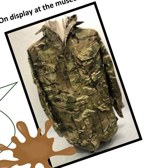
Multi-Terrain Pattern (MTP) 2010