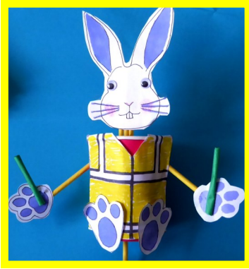
The cup should look like this